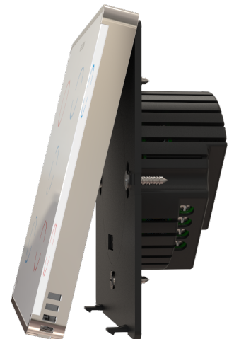
Figure 3: Install Touch Panel Unit

Note: Zero-Cross technology is unavailable if the device operates using DC voltage (24-48VDC).